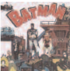
* Burt Ward's big party same Bat-day this year