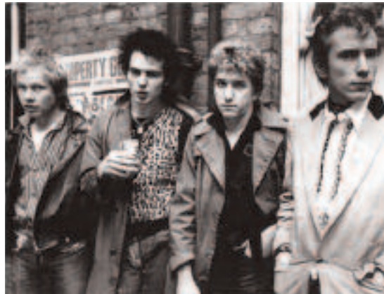
* Deceased and/or no musical ability