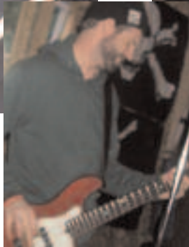
* Much to their chagrin, will appear