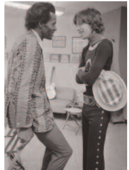
* L to R: Way too old; too old