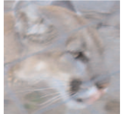
* Couldn't escape in time