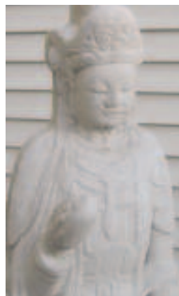
* Doesn't like the venue