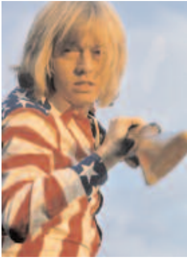
* Permanently barred after what he pulled last year