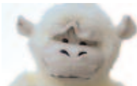
* Busy finisher-izing term of office