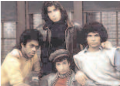
* Commute from Brooklyn too long